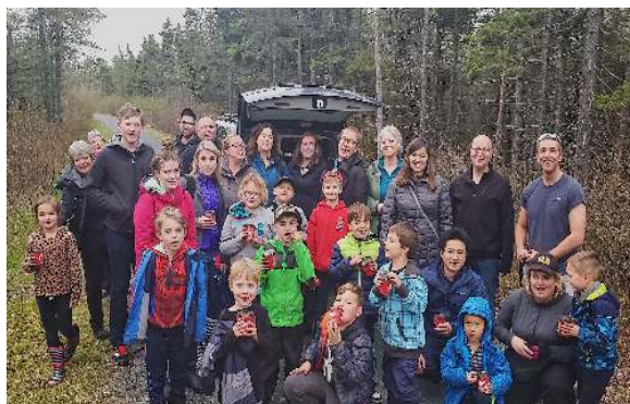
Scouts Tree Planting Team

New Volunteers are always welcome! Come join us Nov 6 th . Share your input and enthusiasm for our wonderful community. For more information contact chair@pehra.info.