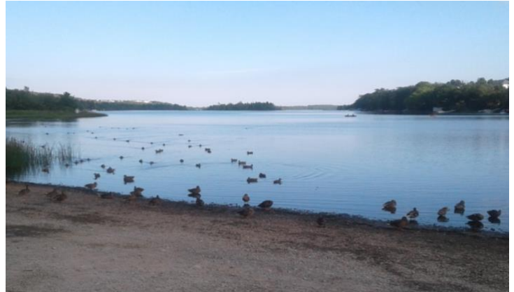
Ducks at the Birches Park boat launch, where feeding often occurs.

https://novascotia.ca/.../feeding-wildlife-full.asp