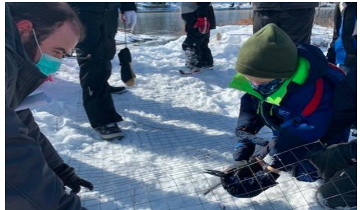
Volunteers at the Tree Wrapping Event on February 13 th

PEHRA and the Scouts have been working in our parks to wrap our "trees at risk" from the beavers living in Morris and Russell Lake. Beavers are herbivores so they cut down the trees to eat the leaves and bark, gnaw on the wood to keep their teeth from growing too long, and use the wood to make their homes or lodges. If the beavers take away too many of our trees, the banks of our lakes and rivers will erode and fish will not have shade to cool the water they live in.