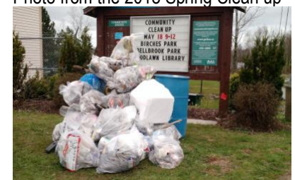
Photo from the 2019 Spring Clean up