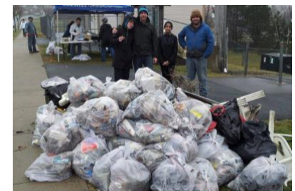
Photo from the 2018 Spring Clean up

The requirements will be subject to change depending on the latest Public Health restrictions and orders. Event updates will be posted to social media. Last year we were not able to host the event due to COVID-19, so we have lots of work to do this year. We hope to see you and your family there to help keep our community clean!